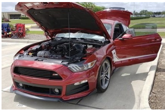
The Hughes Roush is ready for the judges

We had a total of 14 RRCMC Members travel down to Houston Texas to participate in the Mustangs Take Flight Car Show. The trip started with a meet and greet with Breakfast at Denny's in Greenwood Louisiana. The crew cruised together down to Houston after Breakfast and checked into the Homewood Suites by Hilton Houston Clear Lake NASA. The crew unpacked there luggage and then had a relaxing evening at the Hotel. Friday morning the crew was up early and headed out to the Lone Star Flight Museum and got their cars parked. Once Parked the crew got busy and cleaned there cars to get them ready for Judging. After Judging took place the crew then headed over to