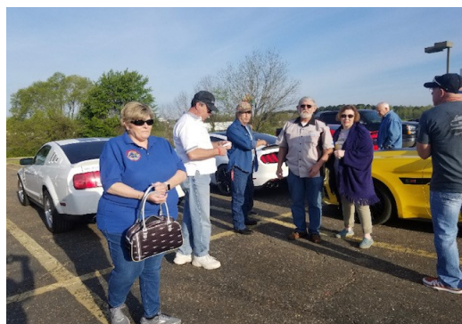
RRCMC Members are getting ready for a big day at the Nasa Space Museum