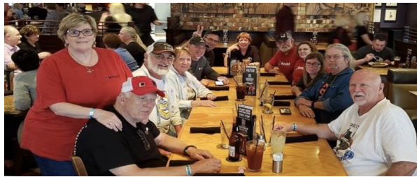
The RRCMC enjoys dinner at BJ's 's Restaurant and Brewhouse