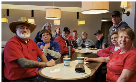
The RRCMC enjoys breakfast before the big day