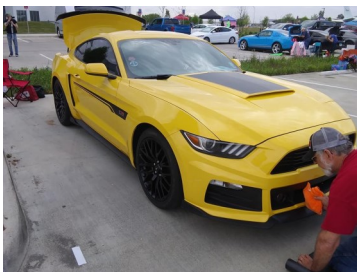
Rusty is hard at work